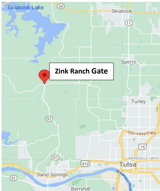
Map Showing Zink Ranch